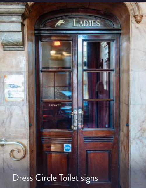
Dress Circle Toilet signs