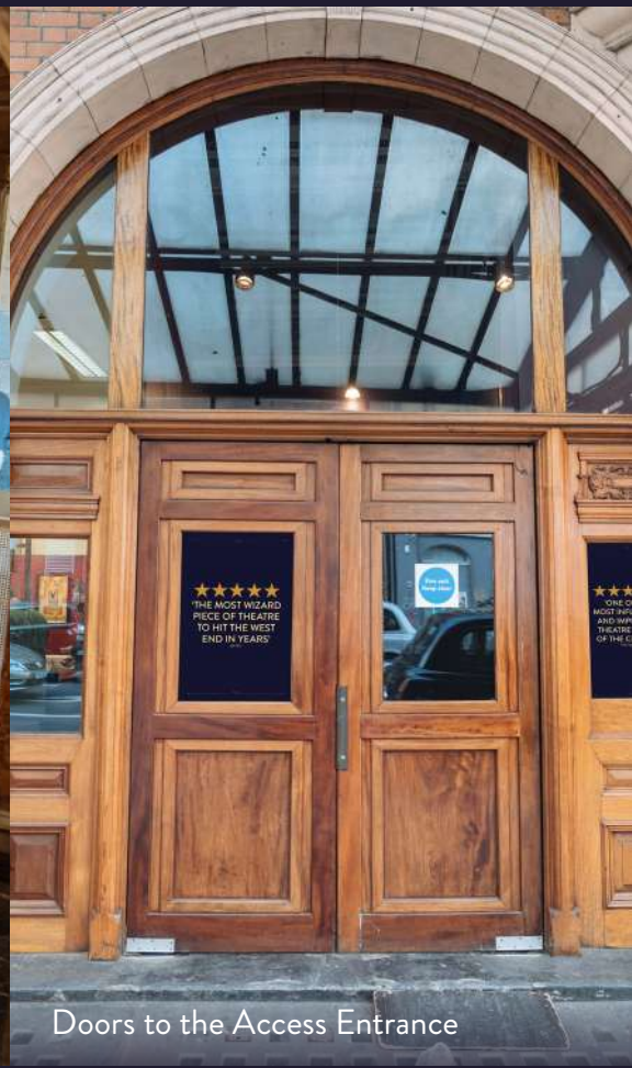
Doors to the Access Entrance

If you've purchased a wheelchair seat, please use our dedicated access entrance located through the side exit door on Shaftesbury Avenue. Please alert a member of our staff, either at the front doors or inside the Box Office, to gain access through this entrance from 45 minutes before the show.