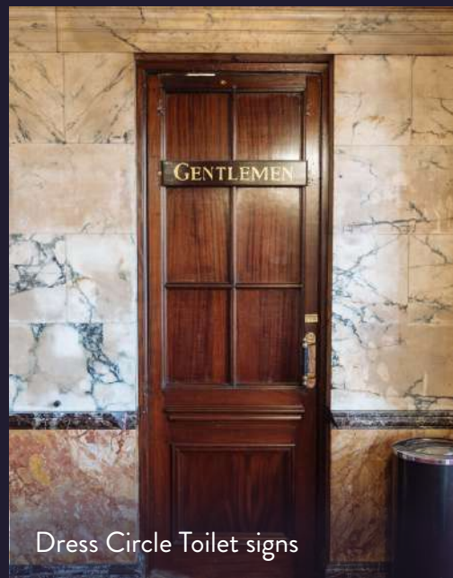
Dress Circle Toilet signs