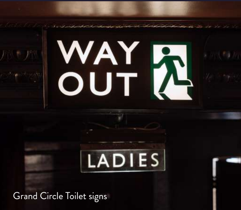
Grand Circle Toilet signs

There are toilets on every level of the theatre, and there will be signs that show the way. If you're unsure of where to go, just ask a member of the theatre staff and they'll assist you.