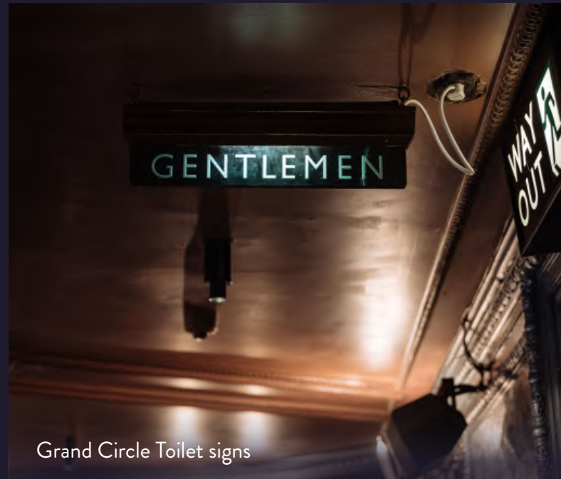
Grand Circle Toilet signs