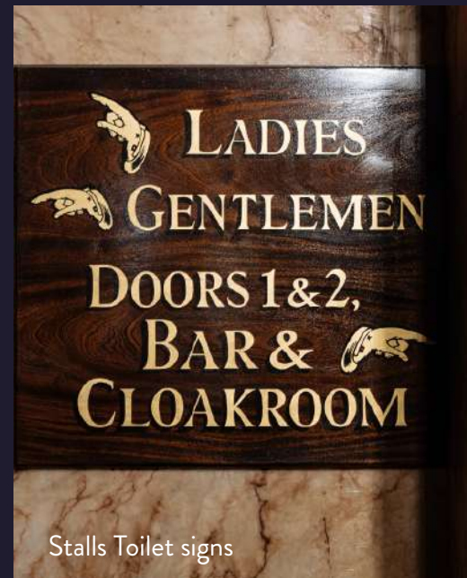
Stalls Toilet signs

Should you need to use the toilet during the performance, a staff member will be near the doors on each level, and they'll be able to show you to the nearest one.